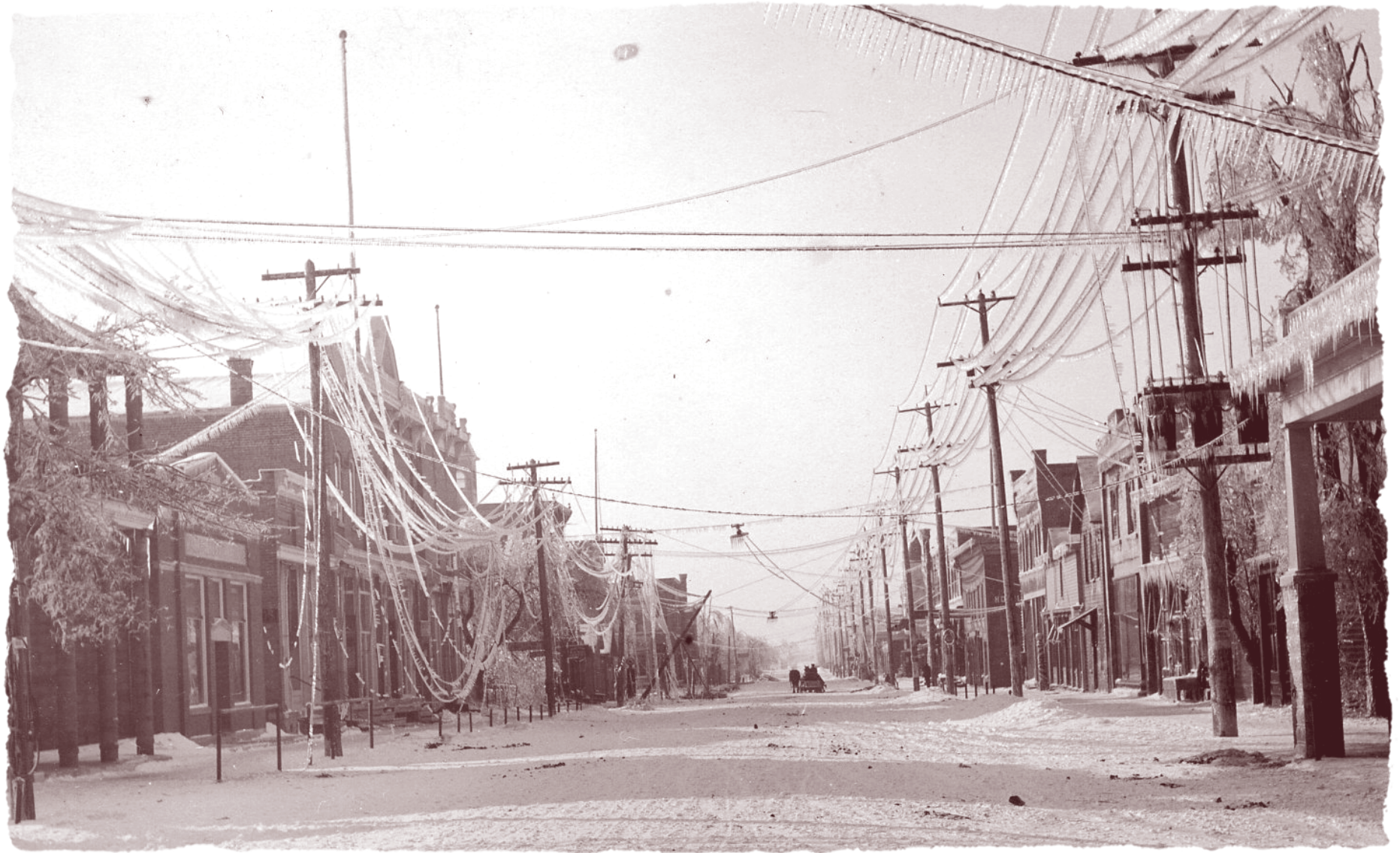
Aftermath of a sleet storm in Brillion on February 22, 1922.