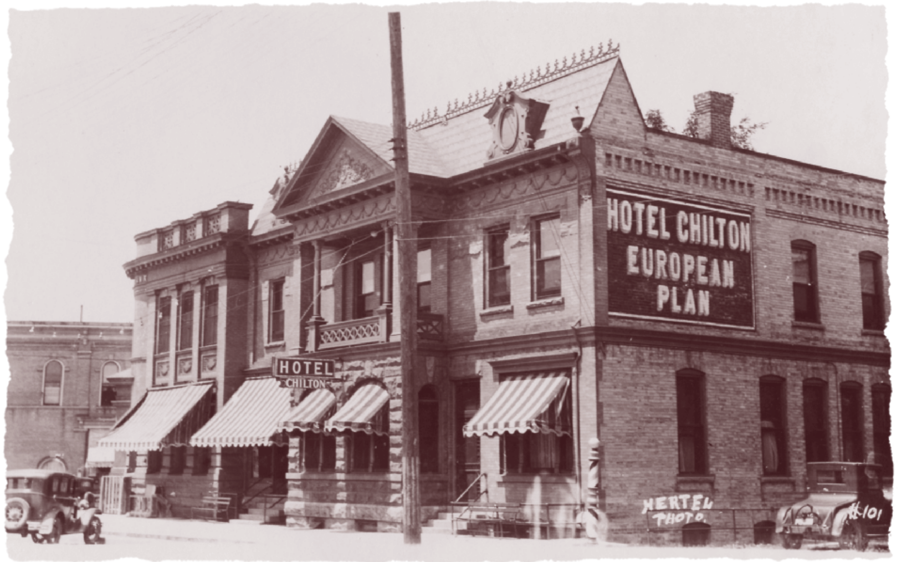
The Hotel Chilton