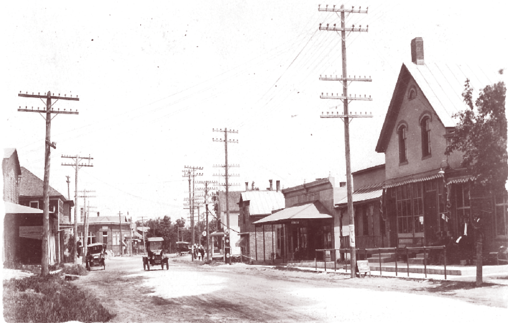
Sherwood street scene - looking north.