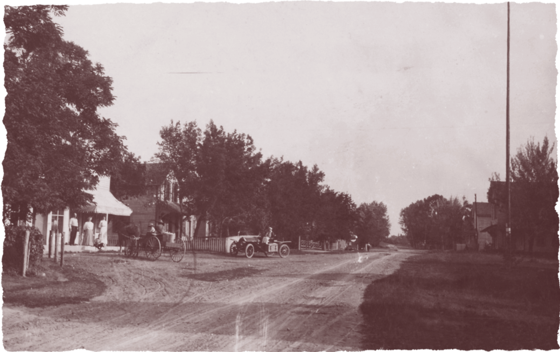
Street scene in Calumetville.