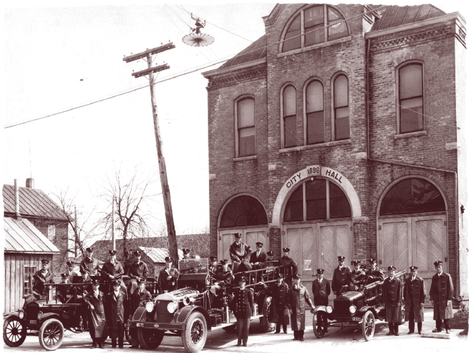
Brillion Fire Department