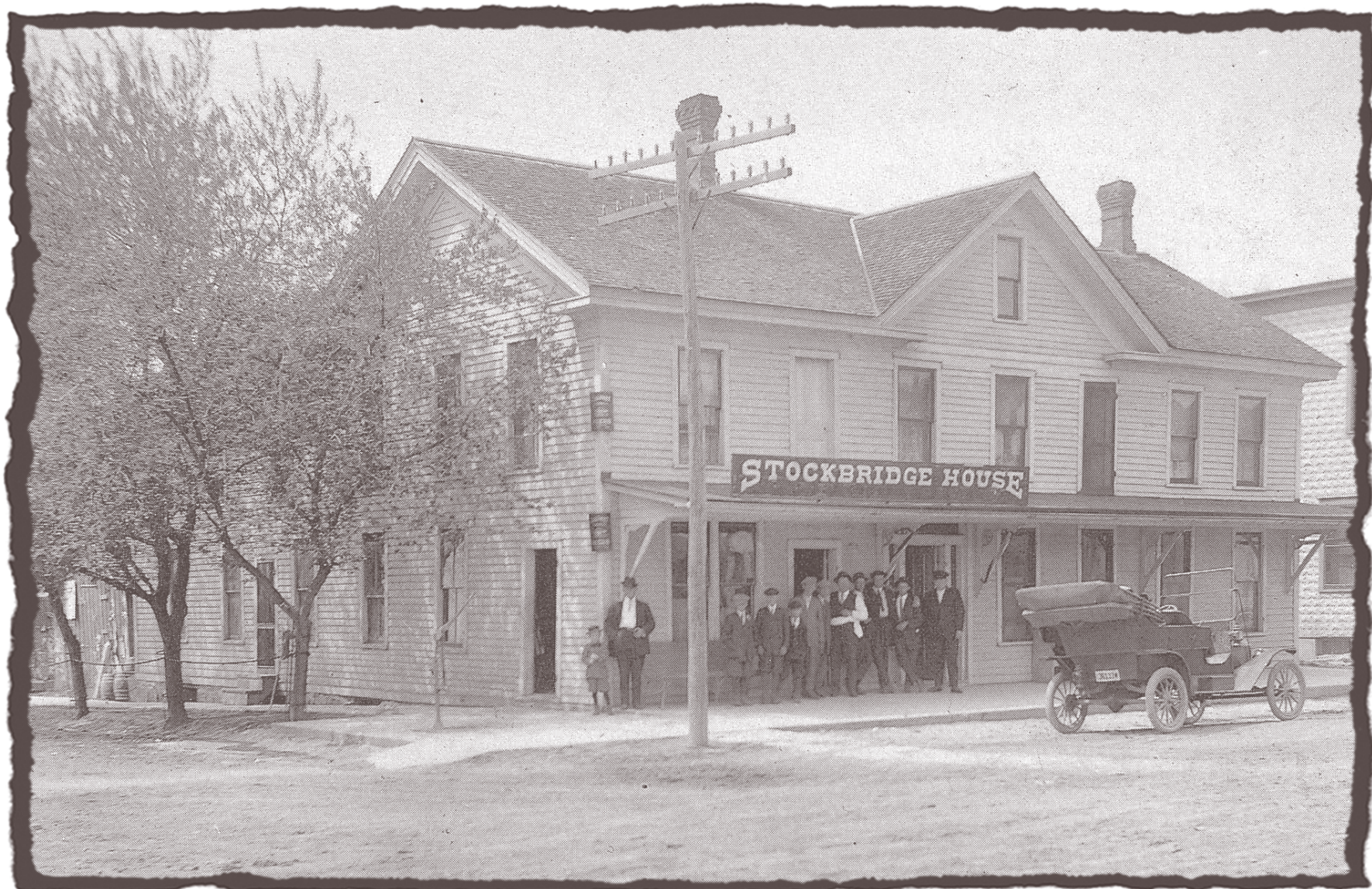
The Stockbridge House boarded guests as well as providing stables for their horses. The building has been extensively remodeled over the years and presently houses The Gobbler's Knob Supper Club, located at 101 N Military Road in Stockbridge.