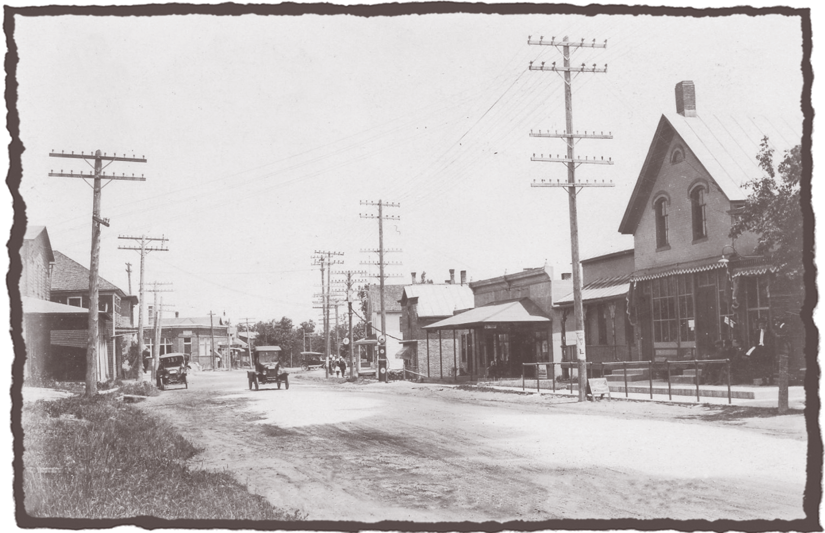
Street Scene, Looking North - Sherwood, WI